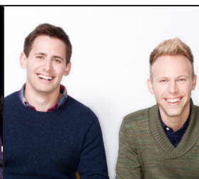
Benj Pasek and Justin Paul